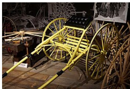
Flint Road-Cart Company road-cart at the Sloan Museum

As he had with General Motors, Durant acquired a range of companies whose cars were aimed at different markets, and therefore, levels of affordability and luxury. The lowest ('entry' tier) was the Star, aimed at the person who would otherwise buy the Ford Model T. Durant cars were mid-market, and the company's entire structure was purposefully very similar with GM; the Princeton line (designed, prototyped, and marketed but never produced)